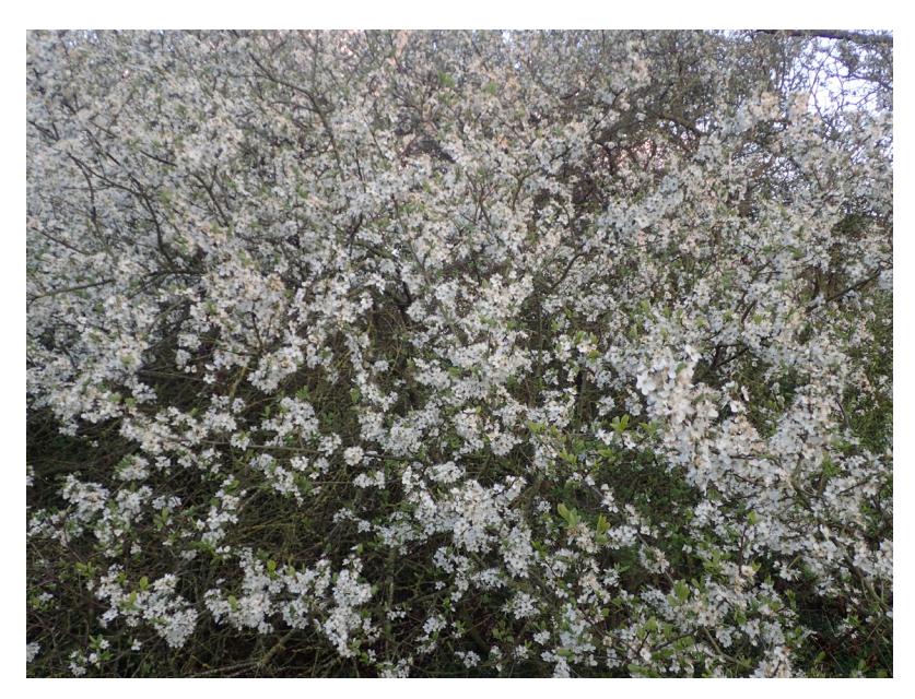
BLACK THORN BLOSSOM